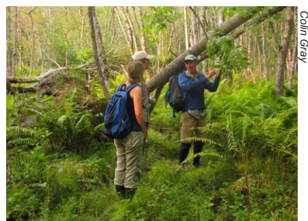
Finding a Black Ash forest in a wetlands just behind an ACPF shoreline on Ponhook Lake