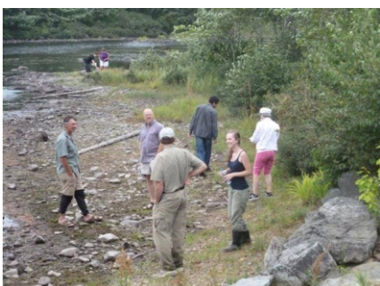
A plant walk at the Molega-Ponhook area BBQ, where local landowners learned about rare ACPF