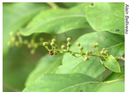
Maleberry, a new ACPF species for NS discovered in 2011