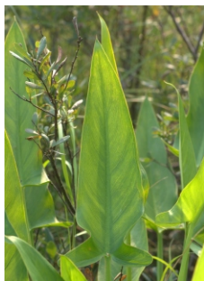
Green Arrow Arum

There were two new ACPF plant finds on lakeshores this year: Green Arrow Arum ( Peltandra virginica ) on Beartrap Lake and Coastal Jointweed ( Polygonella articulata ) on Great Pubnico Lake. Although both are new records to Nova Scotia, more research is needed to determine their extent and how they ended up in our province. Exciting finds, nonetheless!