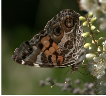
A butterfly lands on a Sweet Pepperbush

I was invited to participate in a Sweet Pepperbush and shore substrate survey of Belliveau Lake, Digby County in late August 2012. The weather was great and the biodiversity found on this lake was eye opening and beautiful. The plant that the MTRI Researcher and I focussed on was the Sweet Pepperbush which was found mostly on the north side of the lake and islands' southerly shores, exposed to the warm midday sun. I found the strong sweet fragrance of the sweet pepperbush excessively pleasant and soothing and the bees, butterflies and various insect activity in and around the Sweet Pepperbush was very interesting and colourful.