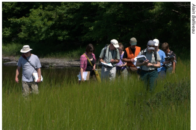
Volunteers learning the plant monitoring protocol on the shores of Ponhook Lake