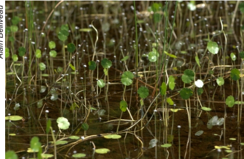
Water Pennywort, a weed in FL and an endangered species in NS