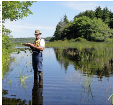
Guy collecting habitat data on Belliveau Lake

The small fish and colourful aquatic insects we witnessed, slightly below the surface of the water, among the aquatic vegetation was equally interesting, as we canoed along the lake's and islands' shore line. The