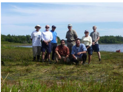
Three botanists, one researcher, and four volunteers work to map out rare plant distribution on Raynards Lake