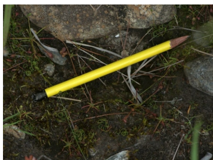
Curly-Grass Fern: The smallest fern in NS, and a rare ACPF species as well